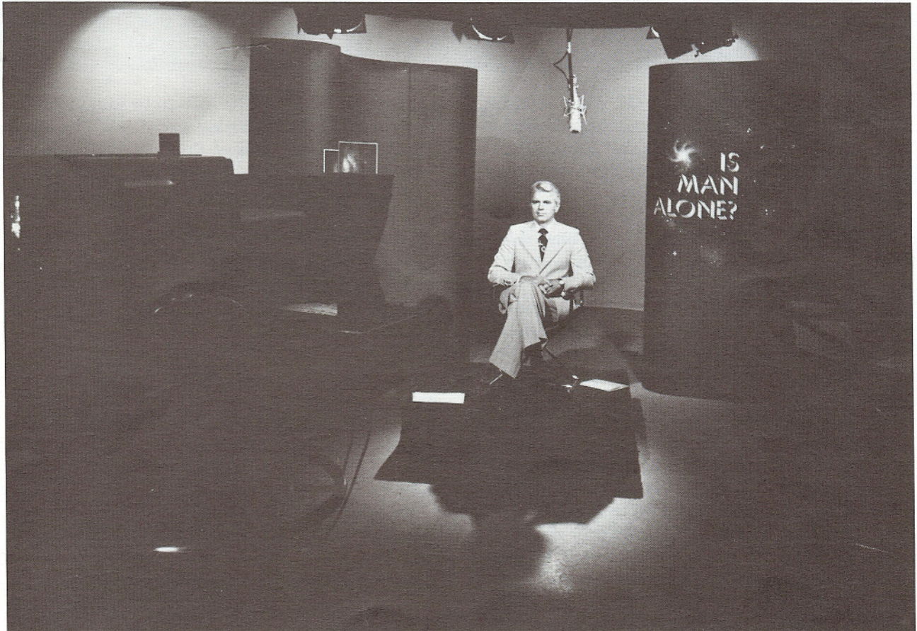
NEW SETS —This season each program will have its own individual set. Above set was used for first new program taped recently. Set pictured on next page was used for second program.

THE NEW SOVIET THREAT —A detailed analysis of the feverish Soviet arms buildup, featuring film from the Soviet Union, which shows some of their newest weaponry. Mr. Armstrong will discuss the prophetic significance of living in the last days. The booklet Are We Living in the Last Days? will be advertised.